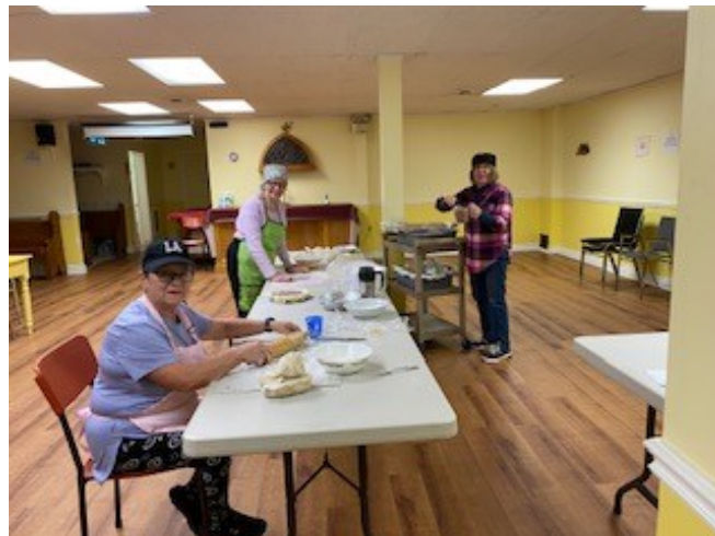
Tortiere baking and preparation were handled by these two groups.

The most recent meal was served on Thursday Dec. 11 and featured tortiere and all the trimmings. The tortiere was part of the nearly 100 pies made during a two day work party as a fund-raising project with many sold to family and friends of parishioners.